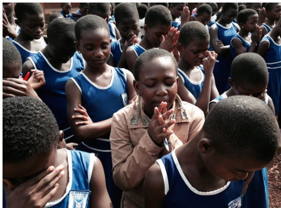
Student responds to the Gospel

Lots of chicken, rice, potatoes, heat, and power outages. But the kind hotel staff made us as comfortable as possible.