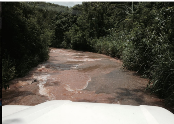
Night time rains turn road to a river

At this point, Ghana is at peace and remains open to the Gospel. God willing, we will return on Sept. 18., 2015.