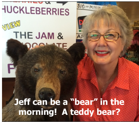
Jeff can be a "bear" in the morning! A teddy bear?