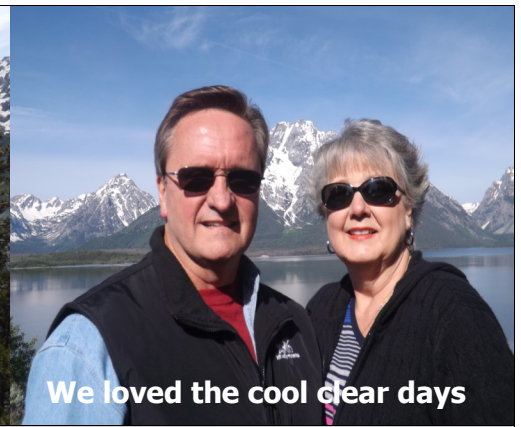
We loved the cool clear days