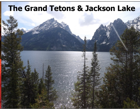
The Grand Tetons & Jackson Lake