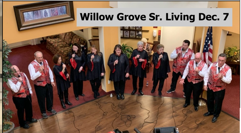
Willow Grove Sr. Living Dec. 7