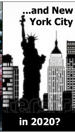
...and New York City