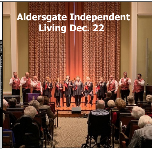
Aldersgate Independent Living Dec. 22

JAMin. Board members & Sunday service team contribute to assisting family in need for Christmas! Over $3000. shared with others in Dec.