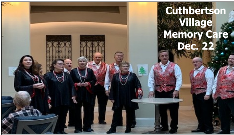
Cuthbertson Village Memory Care Dec. 22