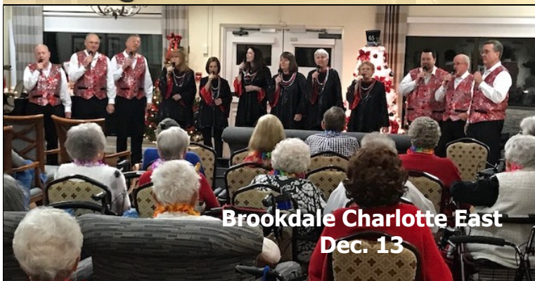
Brookdale Charlotte East Dec. 13