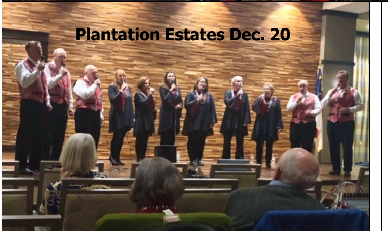
Plantation Estates Dec. 20