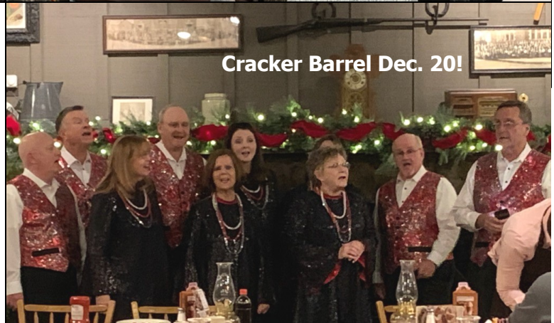
Cracker Barrel Dec. 20!