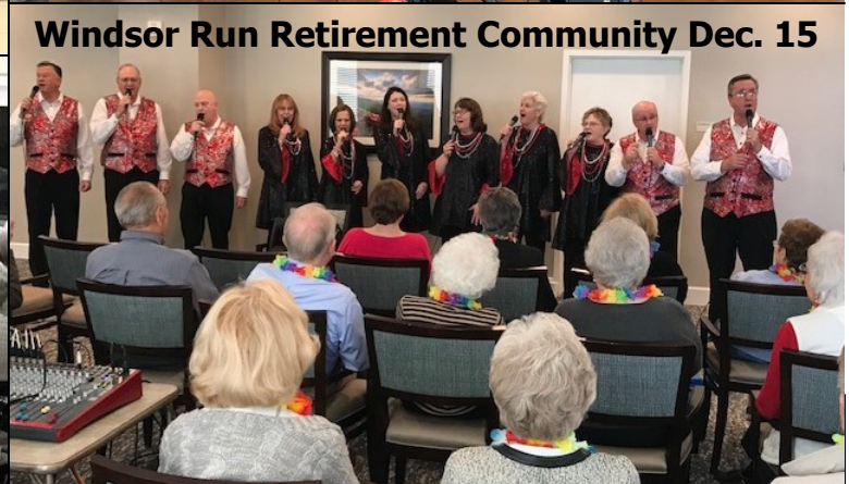
Windsor Run Retirement Community Dec. 15