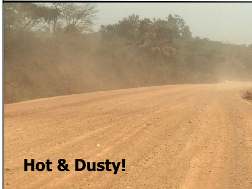
Hot & Dusty!