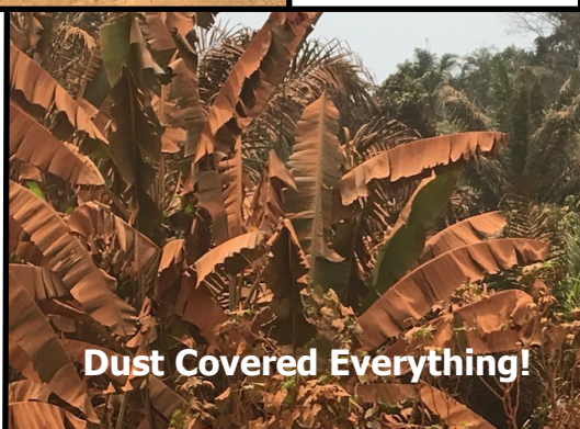
Dust Covered Everything!