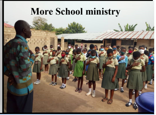
More School ministry