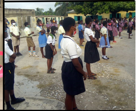
More school evangelism (left)