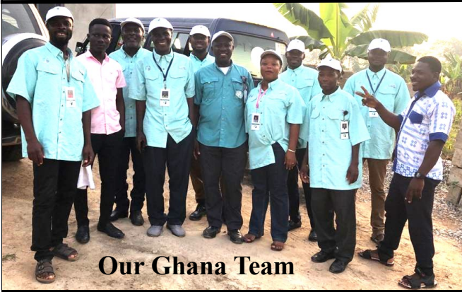
Our Ghana Team