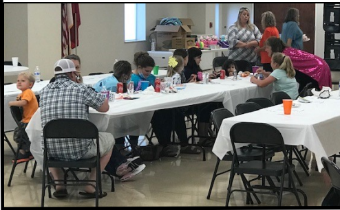
April 10, 2021 lunch w/ prison inmates' families.