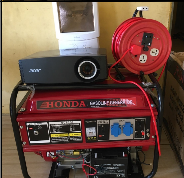
Generator, digital movie projector, necessary drop cords for outdoor film crusades. (left)