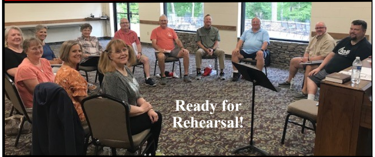
Ready for Rehearsal!

The weather didn't feel like December, but Christmas music was in the air, and there was some Christmas games - and even a few gifts!