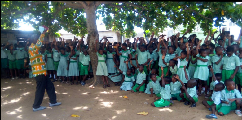
School children respond to Gospel