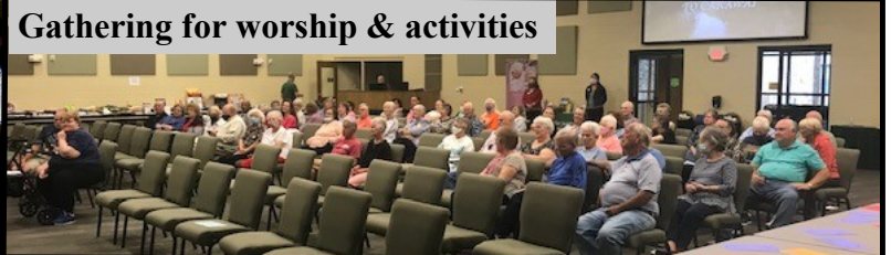
Gathering for worship & activities