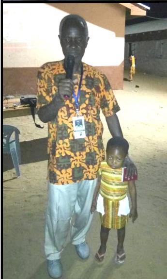
At the close of one nightly Jesus film service, a 4-year old girl came forward & wanted to sing the prayer of faith she had heard so many say. We are told it was touching beyond words! A child shall lead! (left)