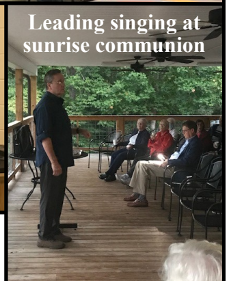
Leading singing at sunrise communion