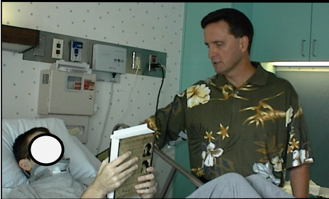
Above 2003 - Ministry to local university student who attempted suicide. Trusted Christ, received a Bible & made a full recovery!

"Call to Me and I will answer you, and show you great & mighty things..."