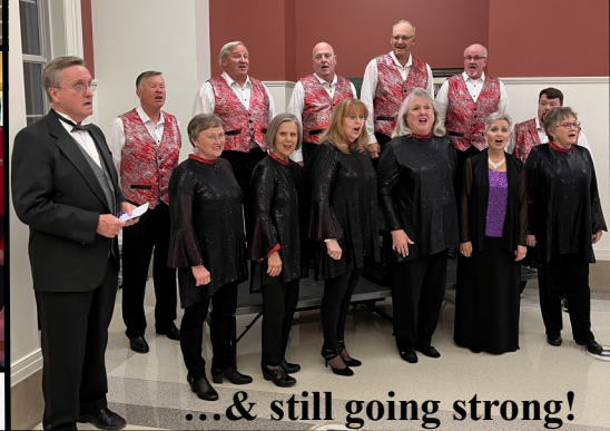
...& still going strong!

More to come about music ministry on p. 4.