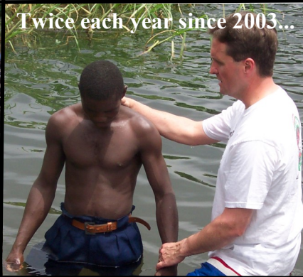
Twice each year since 2003...