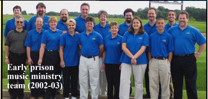
Early prison music ministry team (2002-03)

Thank you for 20 years of prayers and financial support!