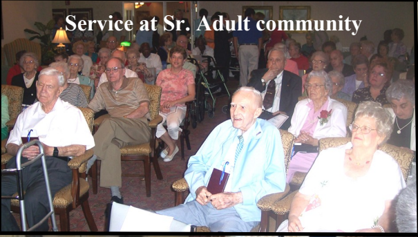
Service at Sr. Adult community

Sr. Adult ministry has been a special blessing!