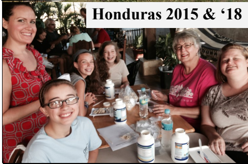
Honduras 2015 & '18