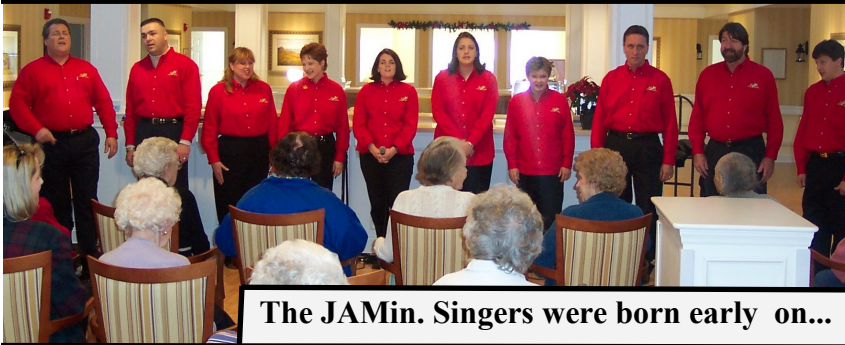
The JAMin. Singers were born early on...