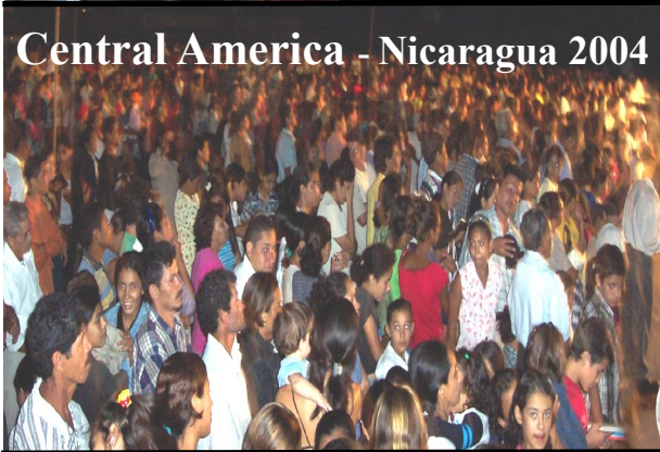
Central America - Nicaragua 2004