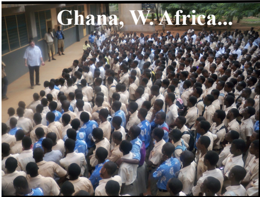
Ghana, W. Africa...