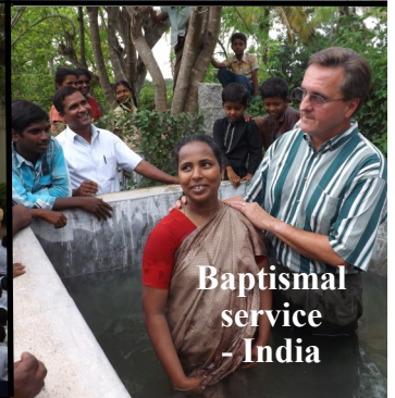
Baptismal service - India