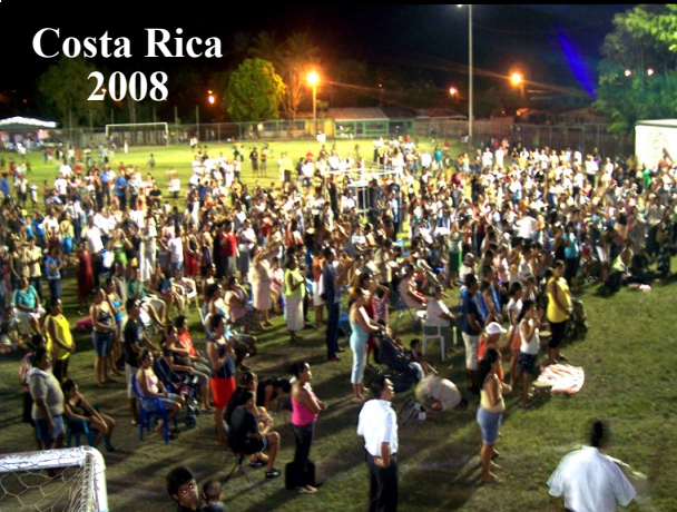
Costa Rica 2008