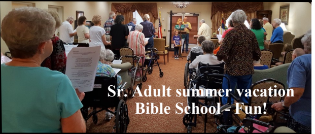
Sr. Adult summer vacation Bible School - Fun!

Ministry at Wilora Lake Lodge (now Brookdale Charlotte East), the Cove, the Little Flower, the Haven, Lawyers Glen, Windsor Run & more!