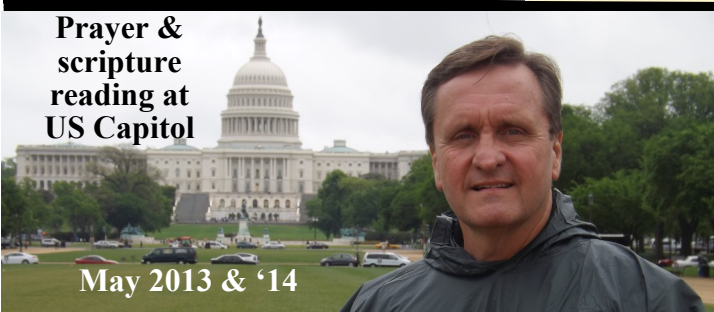
Prayer & scripture reading at US Capitol

Opportunities have created more opportunities. In 2003, singing at the funeral service of a stranger resulted in recording our CD, "Broken Crayons on the Floor" in 2004!