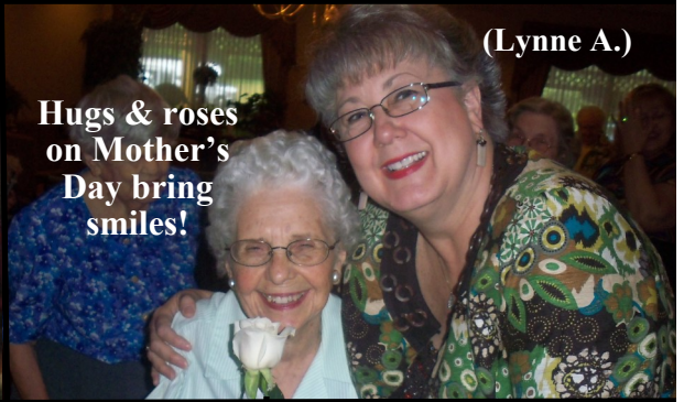
Hugs & roses on Mother's Day bring smiles!