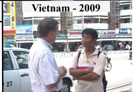
Vietnam - 2009

Less than 2 months into this ministry, we decided not to solicit funds in any way, or even talk about money except to the Lord. Our financial philosophy became, "Why go to men who own a little when we can just go to God Who owns it all?" Everything we do is on a volunteer basis, no fees are ever charged, & even love offerings are not requested - but God has greatly provided! When JAMin. was 7 months old (Jan., '03), we decided that each month we had surplus funds, a portion would be shared with a need outside of JA-Min. We have not missed a month since!