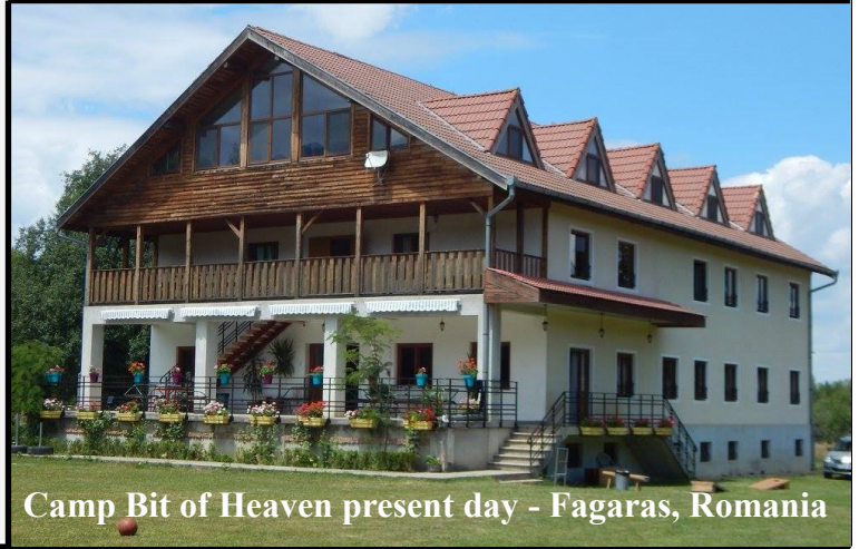
Camp Bit of Heaven present day - Fagaras, Romania