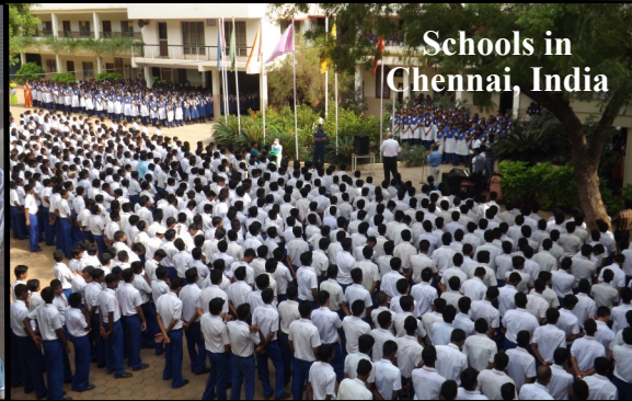
Schools in Chennai, India