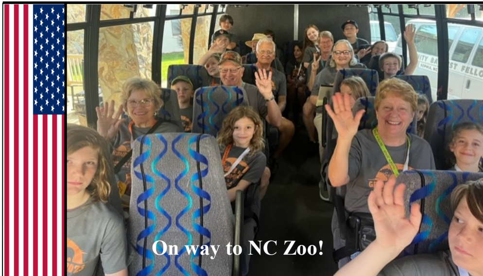
On way to NC Zoo!