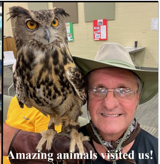
Amazing animals visited us!

Your 2023 2nd quarter donor statement enclosed. THANK YOU for your support!