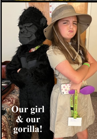
Our girl & our gorilla!

JAMin. never requires or asks for fees or honorariums. Your prayers & gifts enable us to go serve. Thank you!