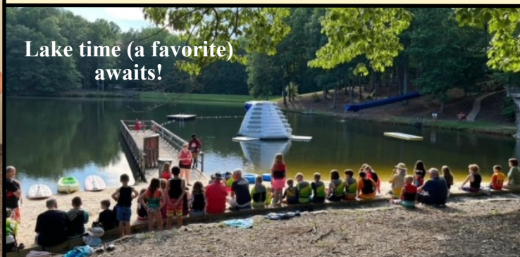
Lake time (a favorite) awaits!

JAMin. never requires or asks for fees or honorariums. Your prayers & gifts enable us to go serve. Thank you!