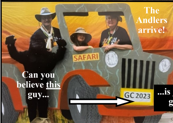
The Andlers arrive!