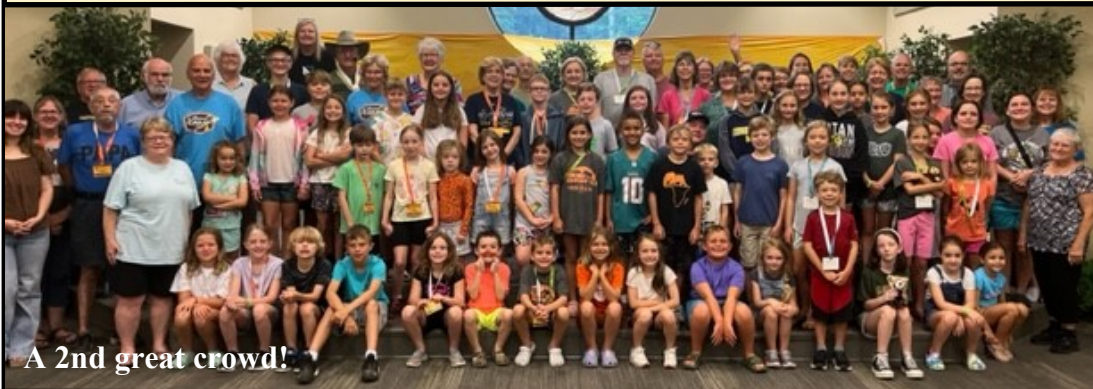
A 2nd great crowd!

Our July Newsletter Highlighted Grand Camp #1, June 26-28, Now... "ON SAFARI," PART 2 (JUNE 29 - JULY 1)