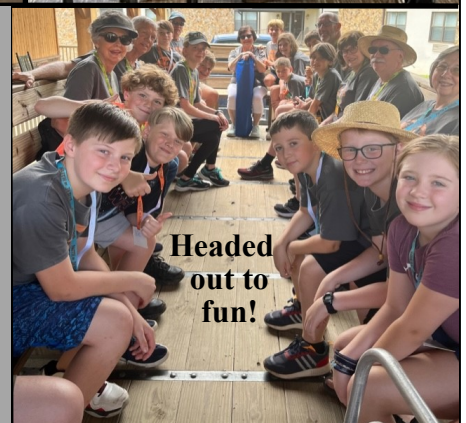
Headed out to fun!