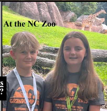
At the NC Zoo