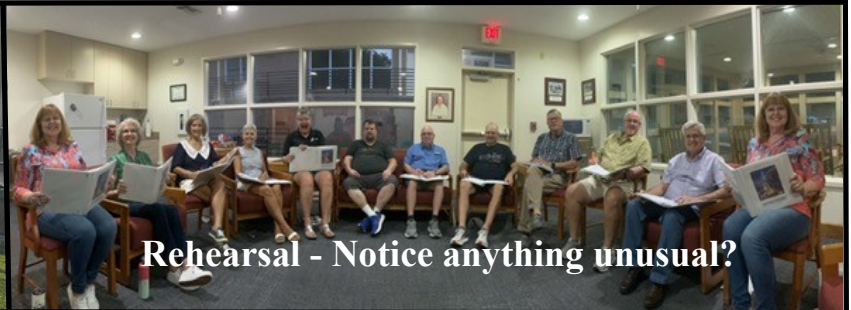
Rehearsal - Notice anything unusual?