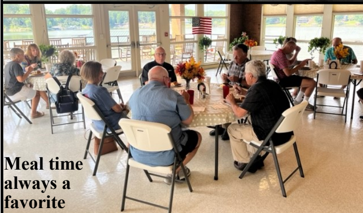
Meal time always a favorite