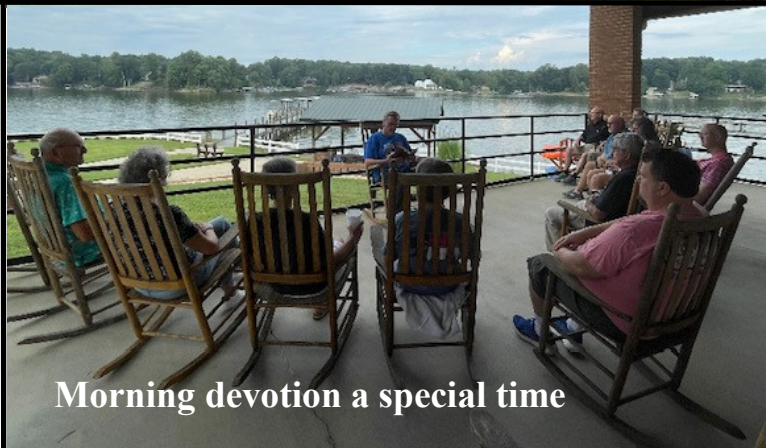
Morning devotion a special time