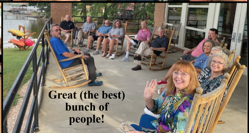
Great (the best) bunch of people!