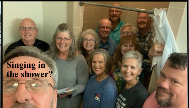
Singing in the shower?