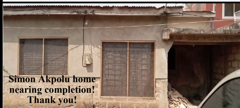
Simon Akpolu home nearing completion! Thank you!