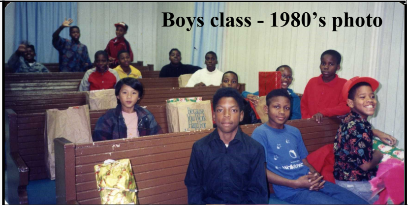
Boys class - 1980’s photo