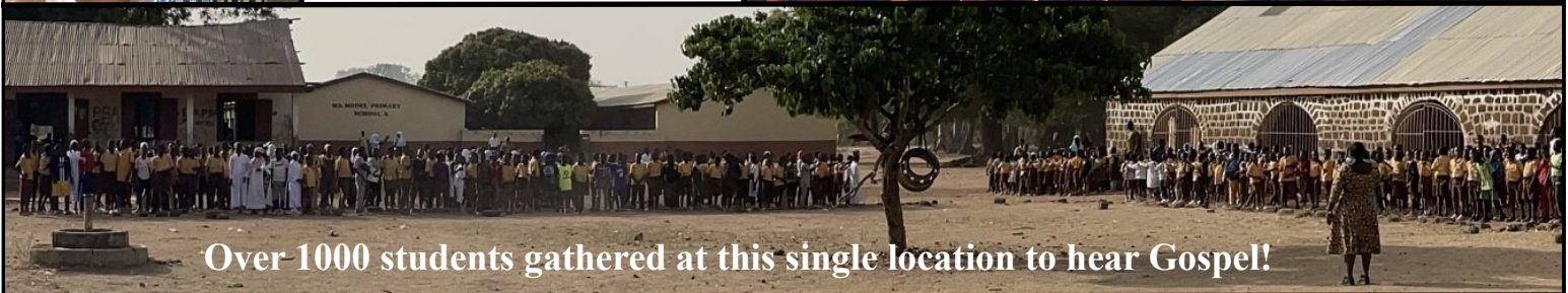
Over 1000 students gathered at this single location to hear Gospel!