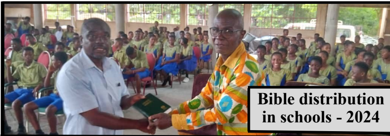
Bible distribution in schools - 2024