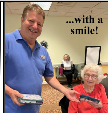
...with a smile!