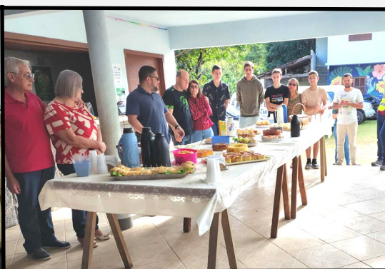
Womens' Addiction Rehab Facility