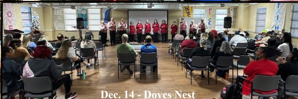
Dec. 14 - Doves Nest Women's Rehabilitation