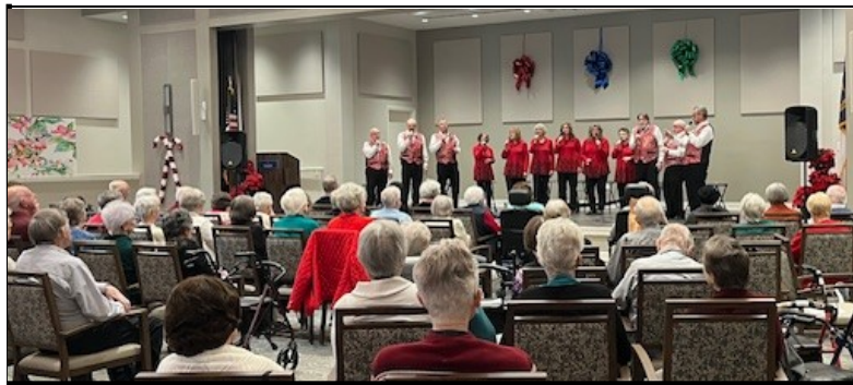
Dec. 21 - Windsor Run Sr. Living - Matthews, NC