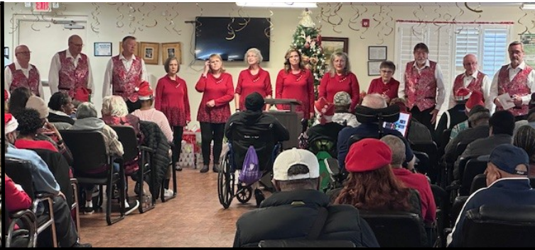
Dec. 23 - Blessed Assurance Adult Daycare, Matthews