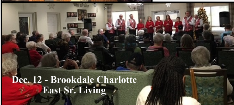
Dec. 12 - Brookdale Charlotte East Sr. Living