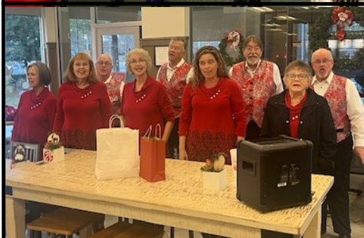
Dec. 12 - Another Chick Fil-a!